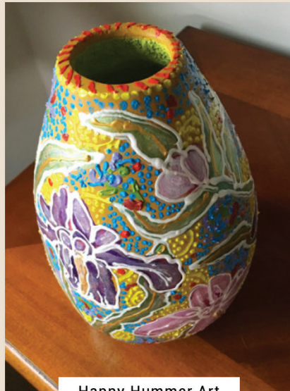
Happy Hummer Art