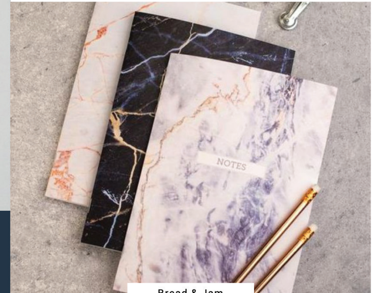
Bread & Jam

Geological contours and stone veinings will remain influential for surface and pattern, but designs should be updated with unnatural digital colours