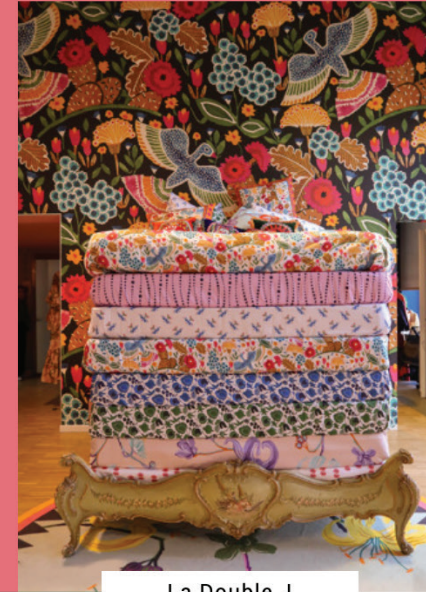
La Double J