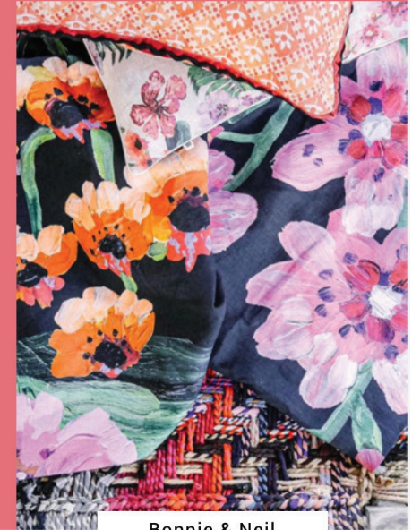
Bonnie & Neil

Use florals to create a kitsch aesthetic , tapping into consumer appetite for interiors that feel more fun and daring